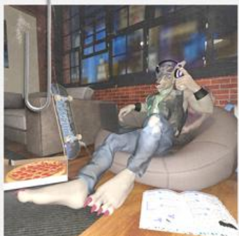
MAVERICK MUSIC STUDY 20XX

Okay, hey music lovers! We're cranking up the volume and diving headfirst into some seriously cool albums, both old-school classics and the latest jams!