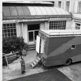
The Rolling Stones Mobile Recording Studio

Secret Lair: They hoted up in this creepy old mansion called Headley Grange to record. It was all about freedom and experimentin'. Plus, they used The Rolling Stones' mobile recording studio, which gave the album its raw, live sound. Bottom line: Led Zeppelin IV come from a time of crazy music, a world in chaos, and a band that wanted to do things their own way. It's a total anthem of musical independence!